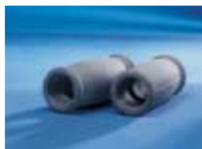
Model no. 6125*, 6126** (not shown)