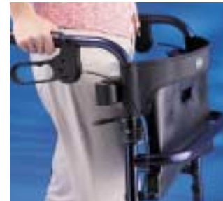
Flip-up seat allows user to step inside the frame.