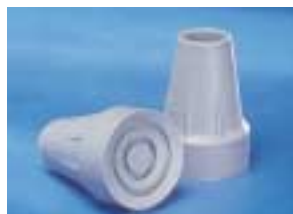
Model no. 6135