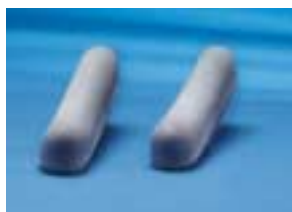
Model no. 6131