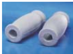
Model no. 7126