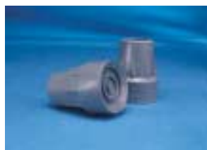
Model nos. 6134, 6135