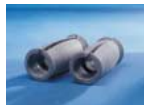
Model no. 6124*, 6119** (not shown)