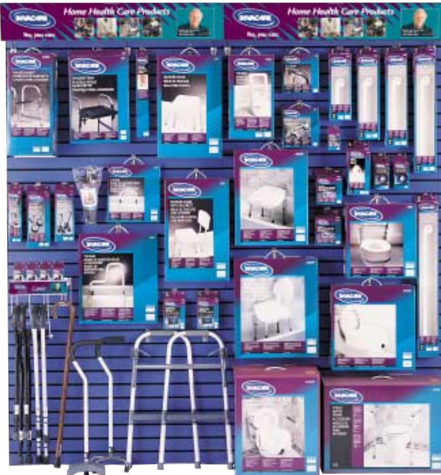
8-foot Planogram shown

Planogram designs are subject to change without notification. Contact 800-333-6900 ext. 6890 for up-to-date information.