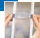
Push handle lock for quick handgrip adjustment.

The one-piece handgrip assembly eliminates the need for wing nuts and other assembly pieces. Plus, the push-button height adjustment and patient height guide allow the crutch to be fitted to the proper user height. This patented model comes completely assembled for the user's convenience.