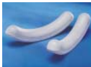
Model no. 7131