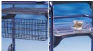
Pictured left: basket. Pictured right: tray.