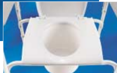
Large 16" wide snap-on seat for added comfort and support.