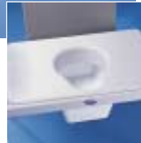
Extra-wide snap-on seat with hygienic opening.